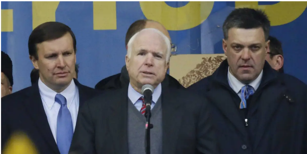
U.S. Senator John McCain, centre, speaks as Democratic senator from the state of Connecticut, Chris Murphy, second left, and Opposition leader Oleh Tyahnybok, right, stand around him during a Pro-European Union rally in Independence Square in Kiev, Ukraine, Sunday, Dec. 15, 2013.

https://www.politico.eu/article/european-union-ukraine-war-debt-crisis-aid-loans-18-billion/