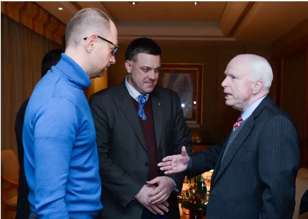
U.S. Senator John McCain, right, meets Ukrainian opposition leaders Arseniy Yatsenyuk, left, and Oleh Tyahnybok in Kiev, Ukraine, Saturday, Dec. 14, 2013.