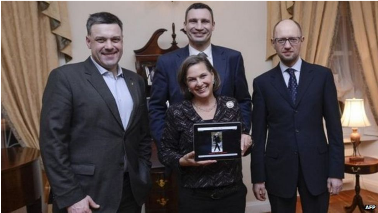
Ms Nuland met opposition heads (L-R) Oleh Tyahnybok , Vitaly Klitschko and Arseniy Yatseniuk 154